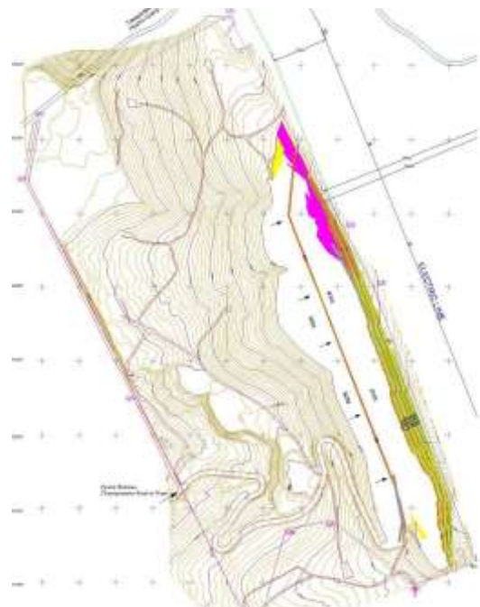
Quarry 5-year Mining & Rehabilitation Plan

Following the ESIA, an Environmental and Social Action Plan was prepared, in line with EBRD and IFC standards, for the Antea project, and among others included the development of quarry management and rehabilitation plans. The Quarry Management Plans (QMPs) for both quarries were completed in 2010 and comprised a structured and practical desk study, providing planning outlines, aligned with the existing (and officially approved) Quarry Mining Projects and Environmental Impact Assessment Studies. In this respect, the QMPs had to align with country legislation and also conform to Titan Group best practices for quarries development and rehabilitation. The QMPs included the overall (long-term) mine plans, the detailed 5-year plans and the first year of quarry operations (focus annual plan), and aimed at ensuring and presenting a rational plan for quarry depletion, mine scheduling and rehabilitation-reforestation of benches.