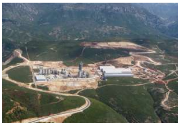
Antea Cement Plant site

The Antea green-field project of Titan Group is located within the municipality of Picrraga and close to the town of Burizana, to the north east of Tirana, Albania, and included the construction of a new cement production facility and development of two new quarries for producing the main raw materials for this operation, over a 'green' area. The project was partly funded by the European Bank of Reconstruction and Development (EBRD) and the International Finance Corporation (IFC). It was classified as 'A' category by the EBRD and the IFC, requiring an Environmental and Social Impact Assessment (ESIA). The ESIA was conducted in 2008 by the ATKINS international consulting company. Further to the ESIA that covered the entire project, focus Environmental Impact Assessment Studies and Quarry Management Plans were developed for the two associated quarries. The Antea Cement Plant has been put in operation since April 2010.